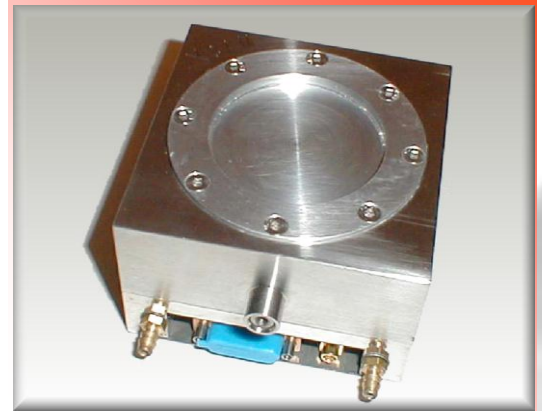
Figure 1 The CCD camera head housing a CCD bonded to a scintillating fibre optic plate (SFO), supplied by Xcam Ltd.

The University of Southampton, with financial support from National Grid Transco, have developed an X-ray imaging technique that allows non-destructive investigation of high voltage cable joints. Defects such as thinning of the semiconducting sheaths, or of the bulk insulation, can be accidentally introduced into the cable joints during manufacture and X-ray imaging allows their inspection. The interfaces between the respective insulation components can be found by differentiating the X-ray image surface profile, which in turn allows the measurement of the thickness of each insulation component. The recorded thicknesses can then be used as a quality measure for a given high voltage cable joint.