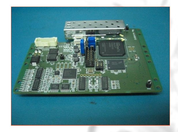
Figure 2 above the 'CHI' board (Camera Head Interface) which replaces the digital board in the stack making our vacuum cameras truly 'fibre optic'

For these reasons, XCAM has developed a truly fibre optic camera system which enables us to provide cameras which have only a power cable to the camera and all control and image data cables are constructed of super-clean fibre optics. The conversion to fibre optic has been made by revising the top board of the stack to incorporate an XCAM proprietary design of fibre optic transciever based on an FPGA.