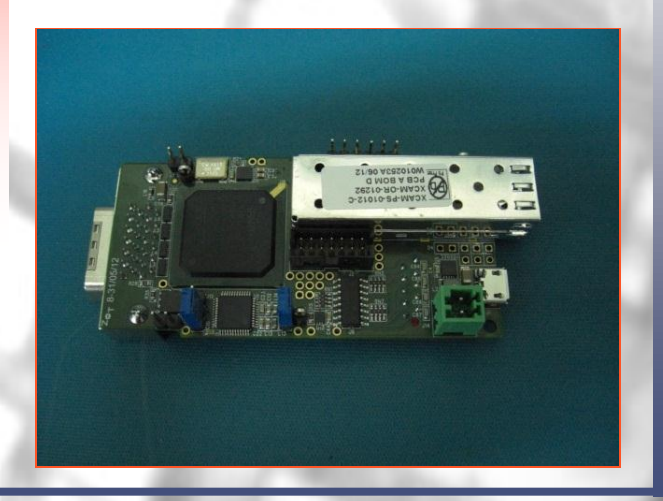
Figure 3 below – the FGA board which can be used as a fibre optic transceiver for many applications.

A separate standalone fibre optic transceiver unit which we call the FGA unit (Frame Grabber Adapter) has also been produced which is used at the controller currently but can be used in diverse applications.