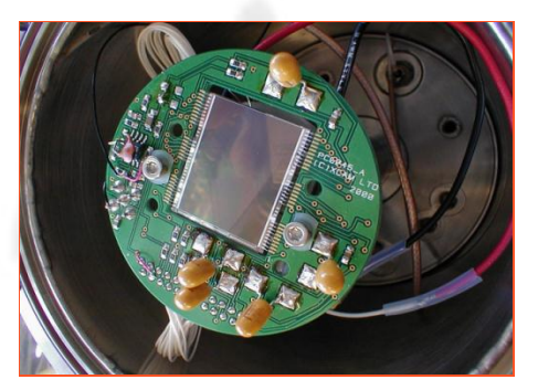
Figure 1 A prototype custom CCD and headboard developed by XCAM Ltd for this work

Researchers at the Commonwealth Scientific and Insustrial Research Organisation (CSIRO) in Australia have developed new X-ray projection microscopy techniques that use phasecontrast information to increase the resolution and information content of images. This work has been funded by XRT Limited, and is currently being commercialised by them. This technique utilises a scanning electron microscope (SEM), as a microfocus X-ray source, together with an optimised sample/detector geometry to optimise the system for 'phase-contrast' imaging. X-ray microscopy has advantages over optical techniques, offering a much greater depth of field, higher resolution, and the ability to image relatively thick, optically opaque and scattering samples.